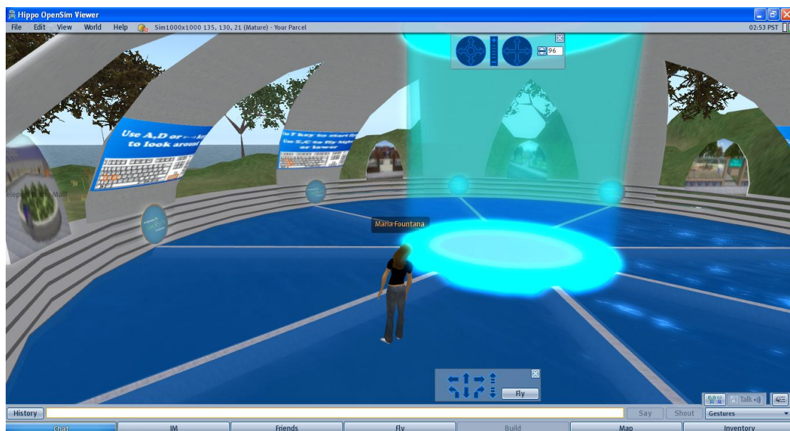
Picture 2: The "Welcome Point" from where you can "teleport" to different areas inside SimSafety