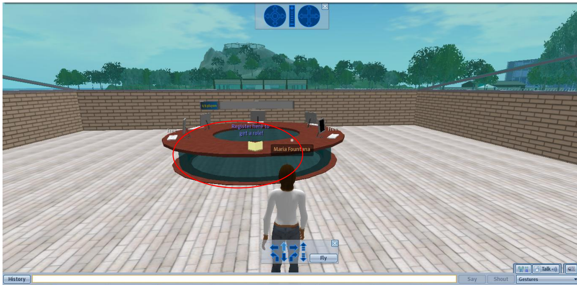
Picture 3: The game "registration book" in the centre of the table. You have to click on it to sign in.