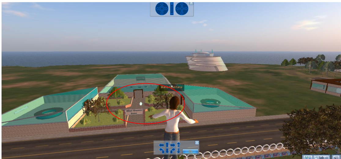
Picture 1: The "Theft" Game Area is situated inside the Mini Games Zone