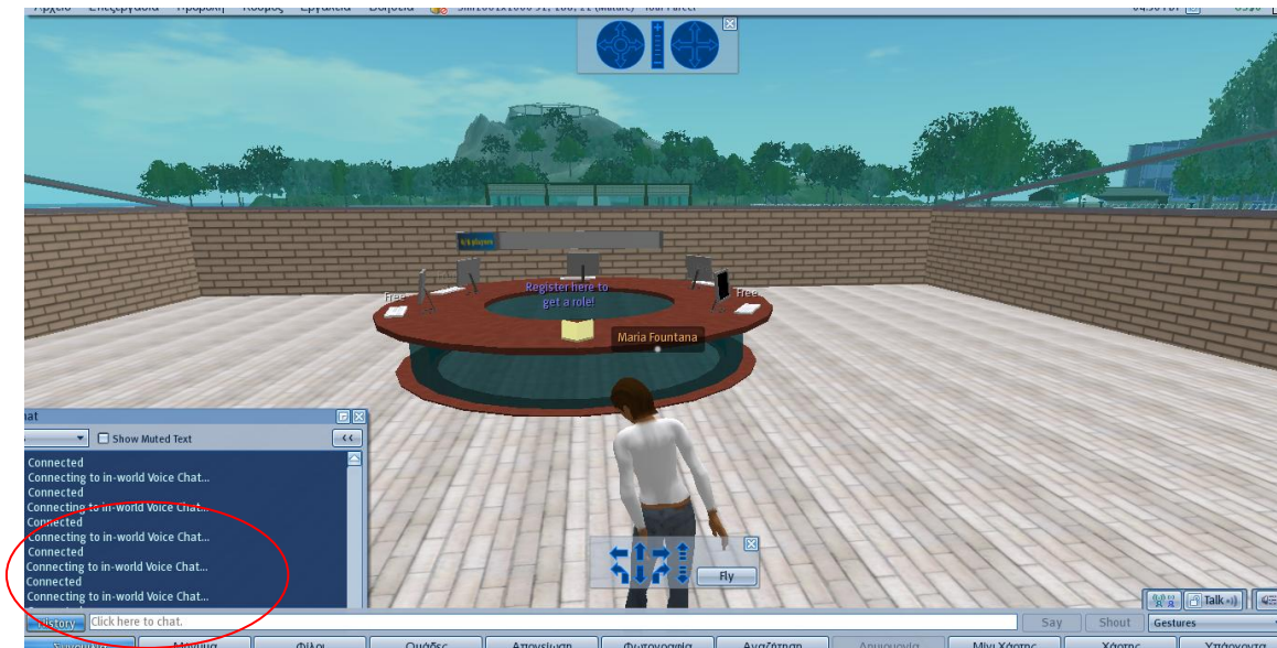
Picture 4: Check the chat inside the game. You will receive your "role" there.

Hint: If you would like to read again your "secret role" click on the "History button on the horizontal menu at the bottom of the screen and scroll up or down to find it and read it again.